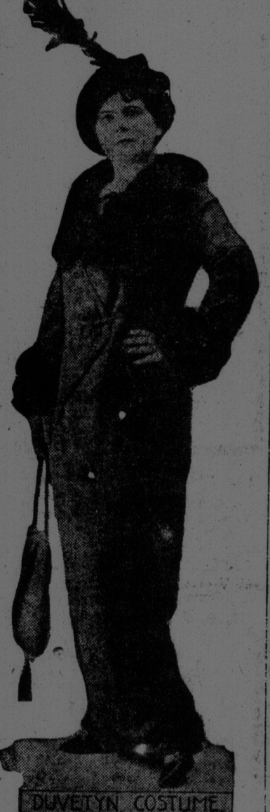
THE HANDSOME TAILORED SUIT ILLUSTRATED HERE IS OF DAVETYN TRIMMED WITH SKUNK. THE NEAT VELVET HAT WORN WITH IT HAS A MADE FEATHER ORNAMENT SET AT ONE SIDE OF THE HAT AT THE ECCENTRIC ANGLE WHICH FASHION DICTATES THIS SEASON.

TAILORED GOWN OF CLOTH AND FUR IN A FASHIONABLE SHADE