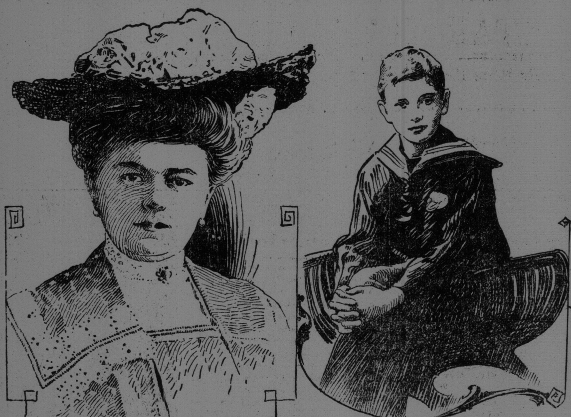
FIGHTING FOR HER CHILD AND A THRONE. Duchess Hohenberg, wife of the late Emperor Franz Ferdinand, who was killed by the assassin, is seen here with her son, Prince Max, who is the heir to the throne.