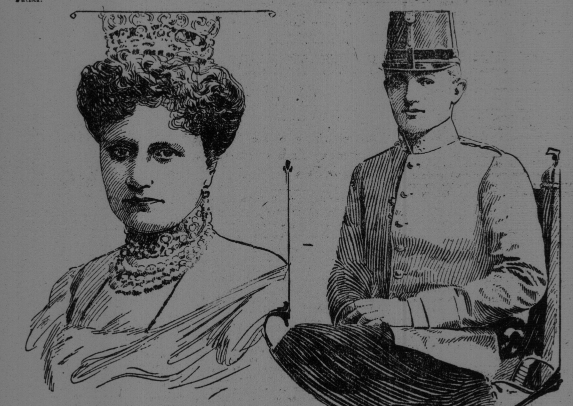
DUCHESS HOHENBERG'S MOST DANGEROUS ENEMY. Archduke Karl Franz Joseph, the son of the late Emperor Franz Ferdinand, is seen here with his mother, Duchess Hohenberg, who is the heiress to the throne.