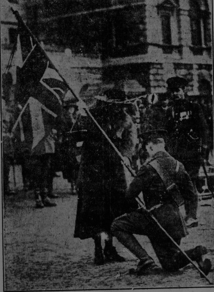
Princess Mary presenting colors at the Horse Guards Parade to the Second and Third Line Units of the London Regiment, Territorial Army.