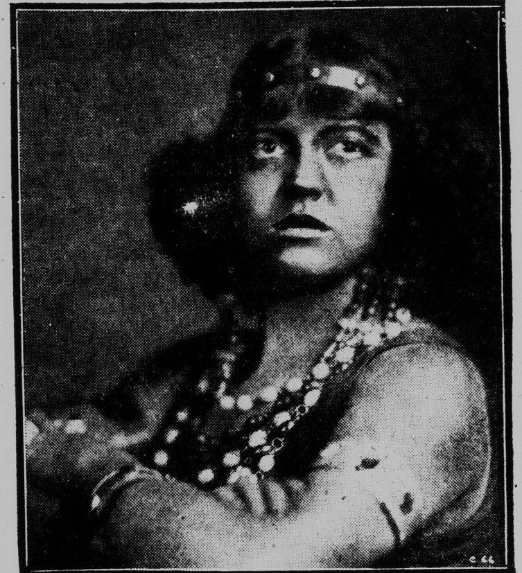
A striking photo of Rosa Ponselle, Metropolitan opera star, as Selika, the slave girl in the opera L'Africana which was brought out of the dusty archives and revived after it had not been heard of for 16 years