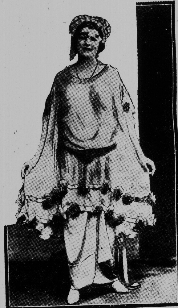
A beautiful negligee of white crepe de chine trimmed with wheels of mountain haze ribbon which was designed for Mrs. Warren Harding