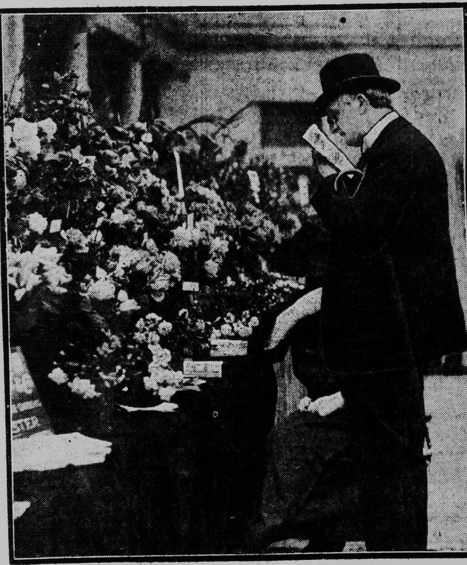
Lord Grey snapped at the flower show in London recently