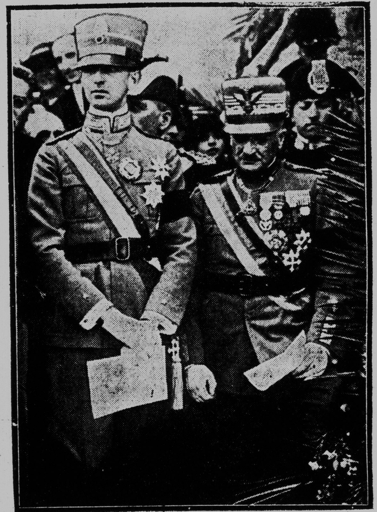
The triumvirate of new Italy. On the right of Premier Mussolini are Prince of Piedmont, heir to the throne, and General Diaz, Minister of War