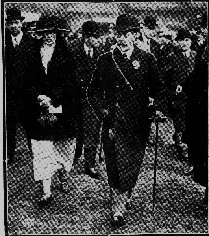
His Majesty in the paddock during the recent races, at Liverpool