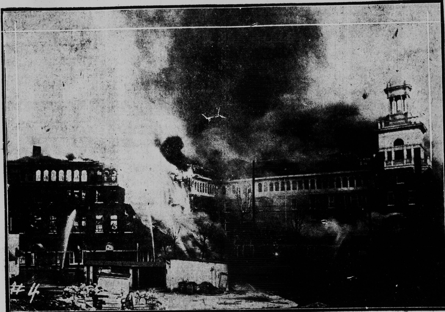
One fireman was killed and two injured when this hotel was burnt at Hot Springs, Ark. Many guests had narrow escapes and the total damage is well over half a million