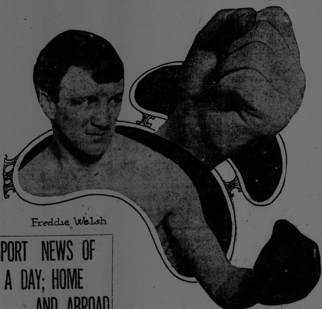
Freddie Welsh SPORT NEWS OF A DAY; HOME AND ABROAD