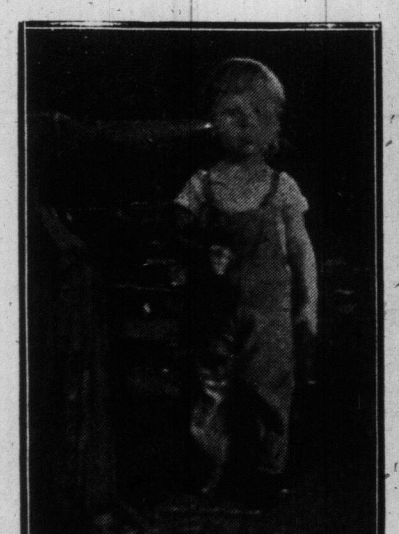
"BRING IN YOUR HORSE." Master Elmer Hooper, a young Thorn-

"Indeed!" Sure. Some day we are going to herd all of our mossbacked near citizens to-gether and have a grand killing."—Cleve-