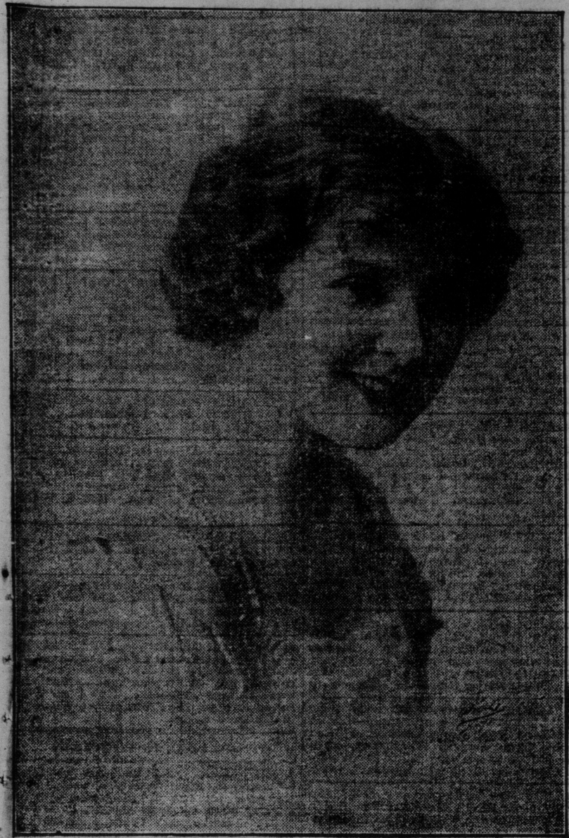
MISS HAZEL DAWN AS CLAUDINE IN "THE PINK LADY" AT THE PRINCESS NEXT WEEK.

After the day's work what's more refreshing than a cup of tea? Be sure it's LIPTON'S TEA GOES FARTHEST FOR THE MONEY