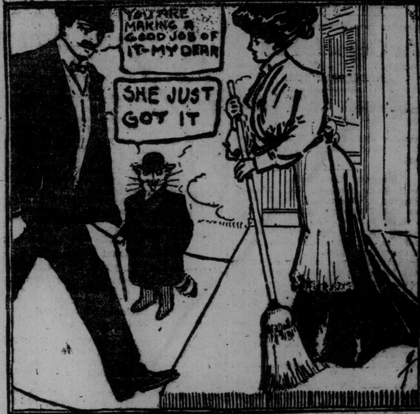
TORONTO WORLD PROVERB PICTURE NO. 2

8. The prizes will be awarded to Toronto Daily and Sunday World readers sending in the correct or nearest correct set of answers to the entire series of seventy-five (75) Proverb Illustrations.