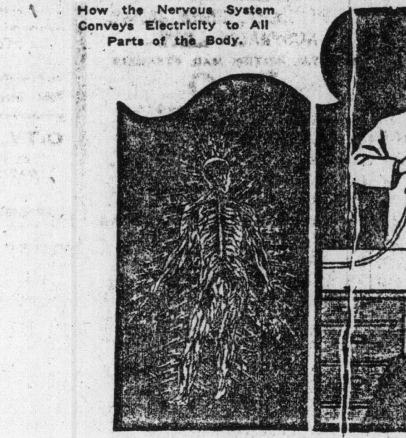
Telephoning With Power Furnished by the Human Stomach.

How the Nervous System Conveys Electricity to All Parts of the Body.