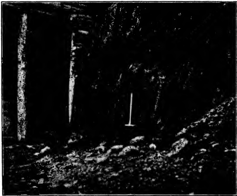
ENTRANCE TO A CROSS-CUT LEADING INTO GOLD-BEARING GRAVEL.

will has But all t prof coun that than on r time prick