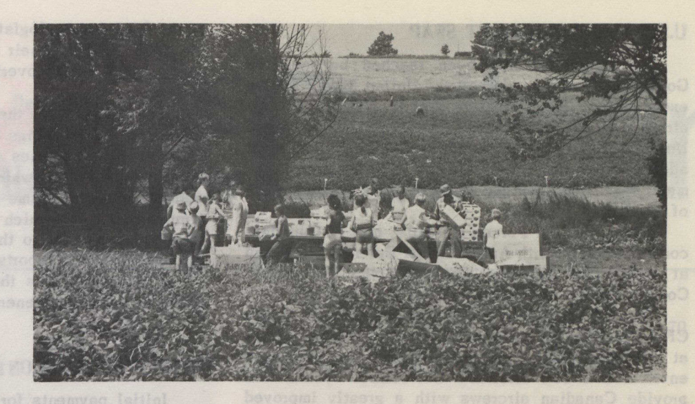
STUDENTS AND STRAWBERRIES