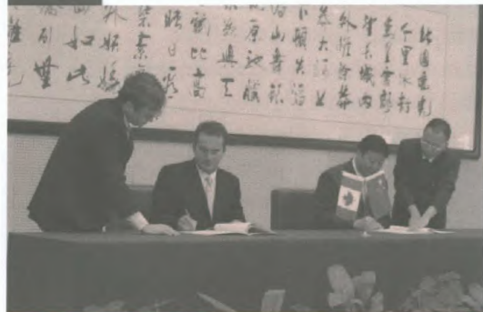
Transport Minister Jean Lapierre and the Chinese Minister of the General Administration of Civil Aviation, Yang Yuanyuan, sign the Memorandum of Understanding on Technical Cooperation in Aviation.

Beijing China > China is the world's fastest growing major economy and has become Canada's second-largest two-way trading partner. A safe, secure and efficient transportation system will be needed to support these growing and important commercial ties. As such, both countries must ensure that their transportation systems are up to the opportunities and challenges of moving an increasing number of goods and people.