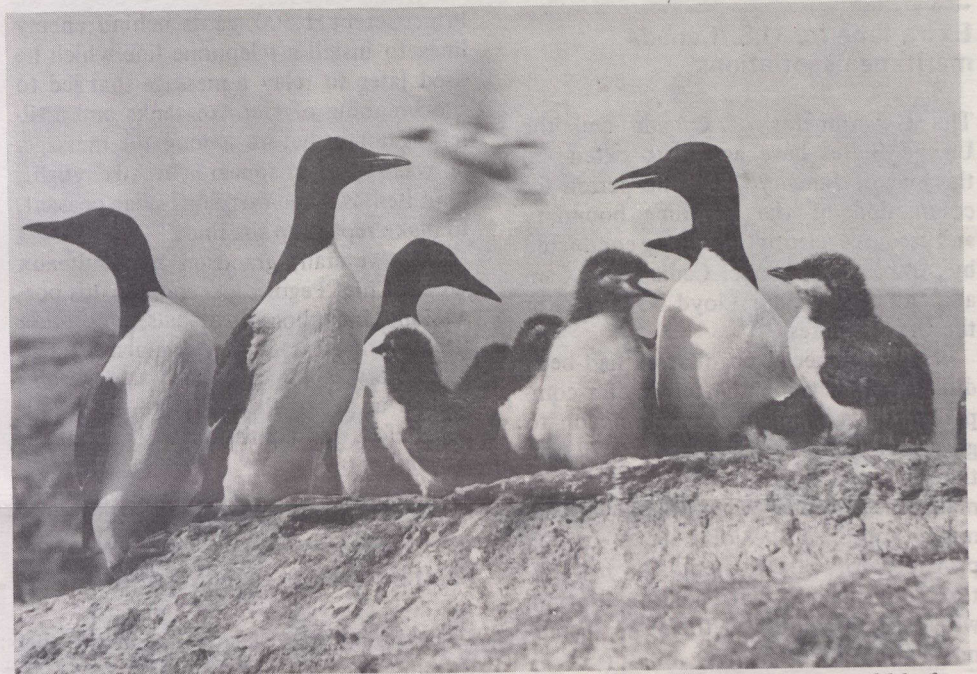
Common mures raise only one chick per pair and must be four to five years old before becoming sexually mature. At the end of summer, groups of flightless juveniles, usually with one or two adults, swim on an easterly migration to winter in Greenland.

Research will also be carried out on ocean fish, Arctic char and inshore fish, zooplankton distribution, sea-bottom animals, effects of oil on mammals, oil degradation and dispersal, oil-spill trajectories and contingency planning. In addition, the research ship CSS Hudson will make two trips into Baffin waters to collect water samples for analysis and to examine the rock formations under the sea.