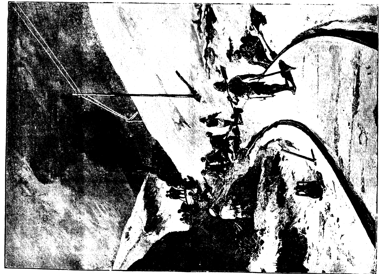
THE LINE BETWEEN THE SANDHILLS OF THE CASPIAN SEA. AFTER A HIGH WIND.