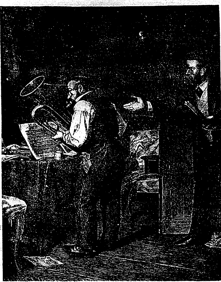
THE TROUBLESOME NEIGHBOUR.