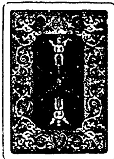
Rider Back, BICYCLE