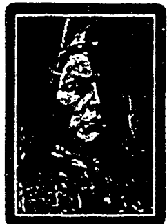
Blackwood Indian Back, CONGRESS Copyright, 1899, by The U. S. Playing Card Co.

21 Mechanics' Building, St. James Street.