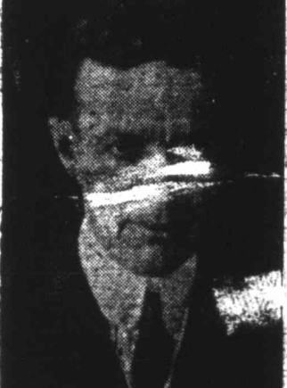
E. W. BEATTY PRESIDENT CANADIAN PACIFIC RAILWAY