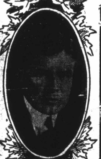
HON. HENRY MILLS MINISTER OF MINES, ONTARIO