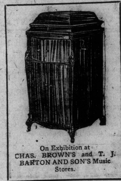
On Exhibition at CHAS. BROWN'S and T. J. BARTON AND SON'S Music Stores.