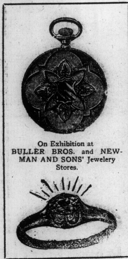
On Exhibition at BULLER BROS. and NEW- MAN AND SONS' Jewellery Stores.

Vote Schedule on Old Subscriptions This Week 6 Months, 5,000; 12 Months, 10,000; 24 Months, 35,000.