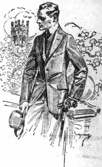
Society Brand Clothes