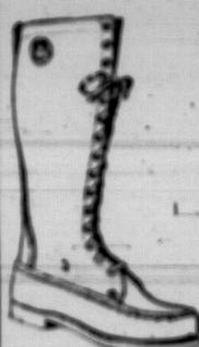
No. 3414. Knee High Front Lace. Hand welted and heavy machine stitched sole. Military Steel Plates. Price, post paid $15.00

Palmer-McLellan Shoe Pack Company, Limited DEPT. W FREDERICTON, N.B.