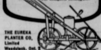
THE EUREKA PLANTER CO., Limited Woodstock, Ont.

The only Rear-Wheel Driven seed Drill on the market. The feed is the "Bacon" handle and without breaking or breaking, and seeds evenly in the soil. Machine instantly converted from a regular seed sower into a hill dropper. Feed cut prevents waste of seed when turning rows. For sowing Sugar Beets, Parsnips, Radishes, Carrots, Cabbages, etc., the "Bacon" model of the "Bacon" is unequalled for strength, lightness, easy running and good work. Write for our complete catalogue.