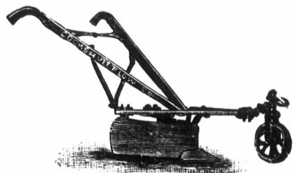
Arranged with Long Hillers for Potato Hilling.