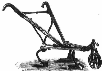
Arranged with Turnip Blades for Flat Cultivating.