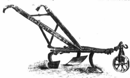
Arranged with Three Teeth for first time through Turnips.

COCKSHUTT PLOW CO., Ltd, BRANTFORD, CANADA.