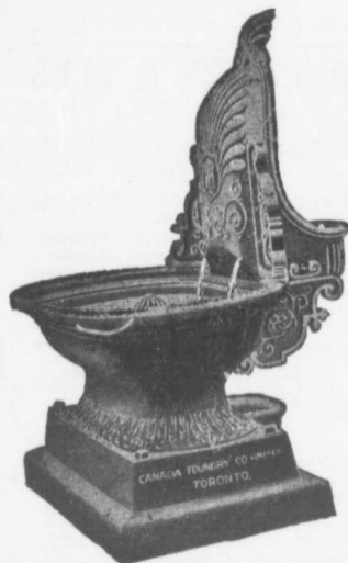
Design No. 1010.

Very Neat and Artistic For Man and Beast.