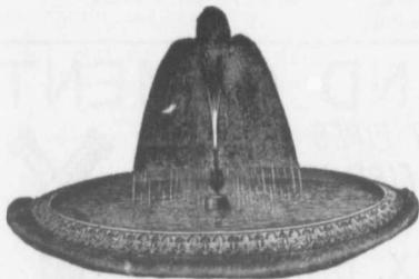
Design No. 1007.

Very Neat and Artistic For Man and Beast.