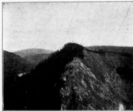
"A wedge-shaped wall of rock separates the modern South Fork from the ancient stream."

The present face is 350 feet deep and consists of top gravel (40 to 50 feet), boulder clay, and about 200 feet of yellowish gravel—out of this gravel it was that the giant during the last four days of the run washed $8,000. The lower portion of the pit has been bared to bed-rock by the removal of the gravel in four benches. This method of washing was necessary because of the grade of the sluice, though had the company permitted Mr. Hobson he would have driven a sluice through the eastern rim and washed to bed-rock at one blow. The main sluice is 1,200 feet long, 1,150 feet of which was cut through bed-rock at a cost of $27,000; above the cut the sluice forks, and each prong is 1,100 feet long, thus making the total amount of bed-rock flume 3,400 feet. The sluice boxes are seven feet wide and four feet deep, paved with improved steel riffles and with blocks, and run on a grade