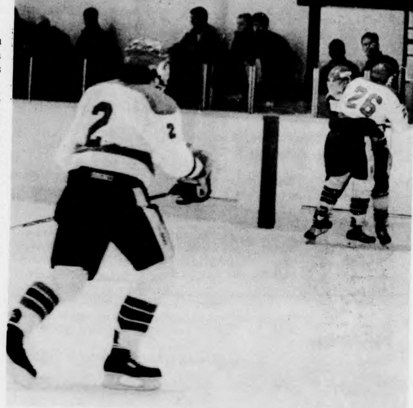
Unfortunately for this Laurier defender, his team couldn't tie up the Yeomen, and went down to a 5-2 defeat.

The soccer Yeowomen host the 5-0 Lady Blues this Thursday at 4:30 in