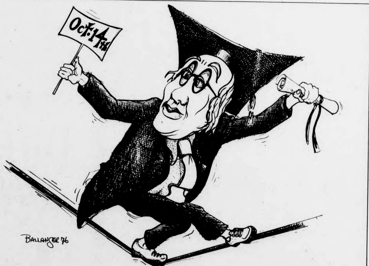
What will Yorkers do on October 14?

"I will not be at work on the 14th. I am a member of YUSA and YUSA has recommended that its members stay off work on that day. The 14th concerns students also, not directly since they are not part of the labour force, but because they may suffer because of the protest. It is unfortunate that the students will be hurt because of the protest, but it is necessary for the workers to stick together."