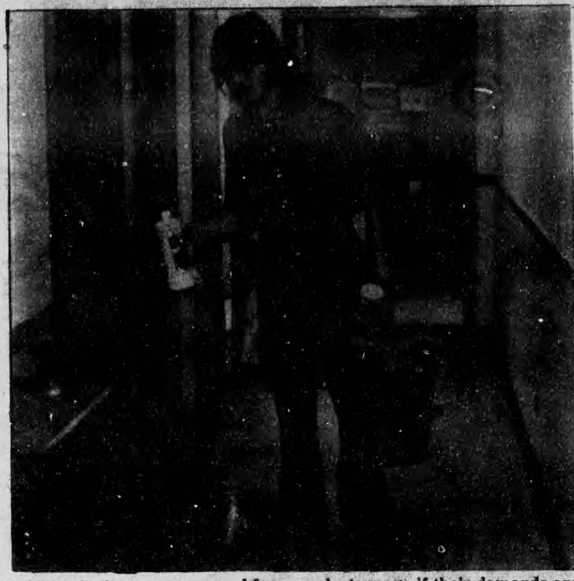
Campus janitors are prepared for a work stoppage if their demands are