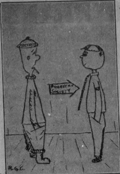
Are you one too?

CONTAINS A MIND AS WELL - AND TO KEEP THIS MIND FLEXIBLE A GOOD HOBBY IS NECESSARY - COVEY THE STATIONER HAS THE LARGEST PHOTO-GRAPHIC ASSORTMENT IN TOWN.