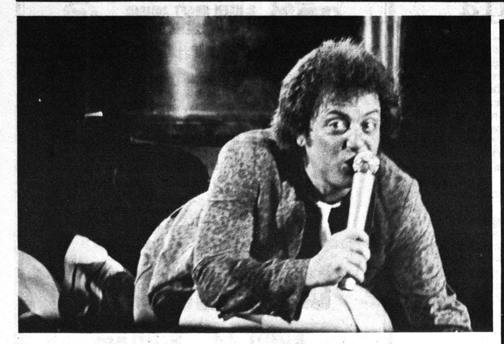
The star indulges in some quadrupedal activity. The audience eats it up.