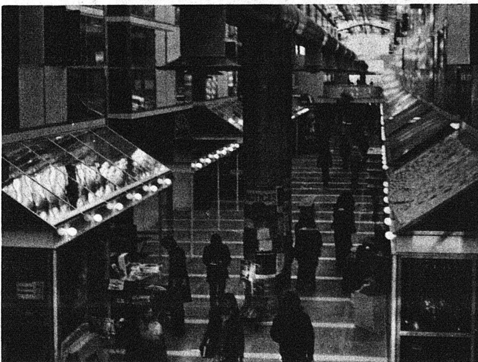
HUB - "Probably the greatest detriment the Students' Union has."

they are used by a limited number of students.