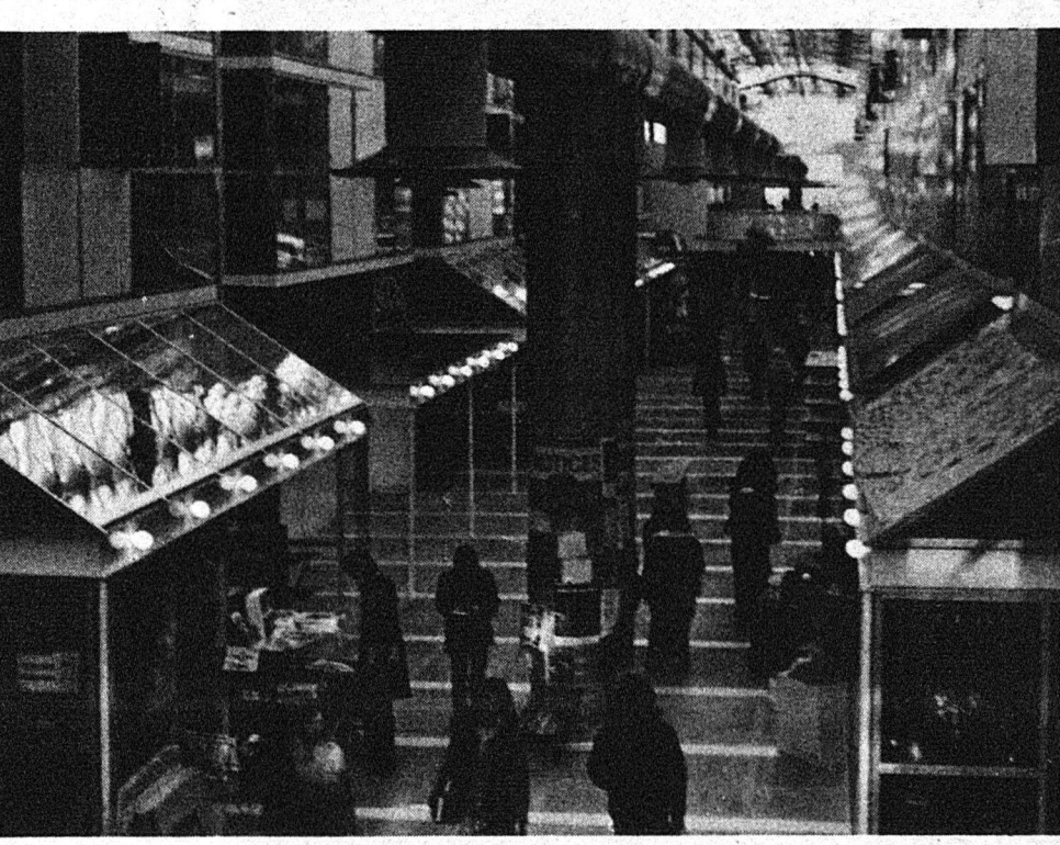
HUB - "Probably the greatest detriment the Students' Union has."

they are used by a limited number of students.