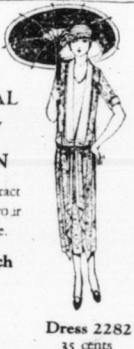
Dress 2282 35 cents

15c to 35c each including free Pictograph