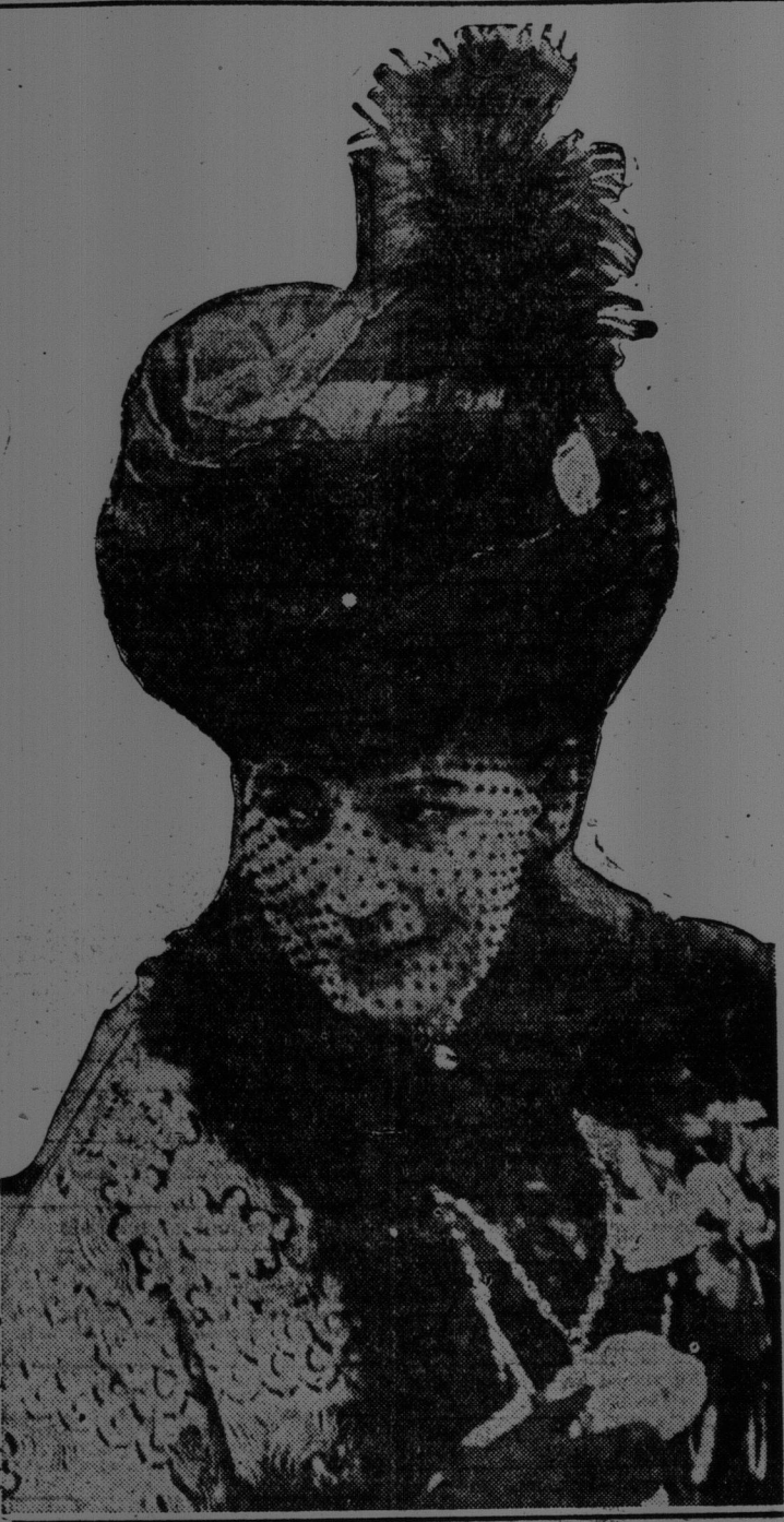
One of the latest photographs of the Queen Mother, taken as she was driving through the streets of London.

from enemies' heads is still a Persian record, was murdered by his Palace guards. Persia is a land of exotic scenery and exotic people, both slightly theatrical in their beauty. Its Omarian fatalism of laissez faire inclines it to welcome strong-handed rulers. Consitutionalism is far too fatiguing—and prosaic—for Tehran. It requires some one vivid to give it the law and the prophets with a dash of bright scintillation.