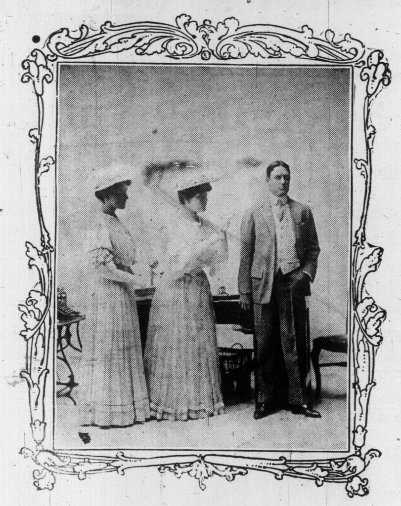
SCENE FROM "THE PENALTY," THE NEW DOMESTIC DRAMA

TO BE PRESENTED AT THE GRAND ALL THIS WEEK