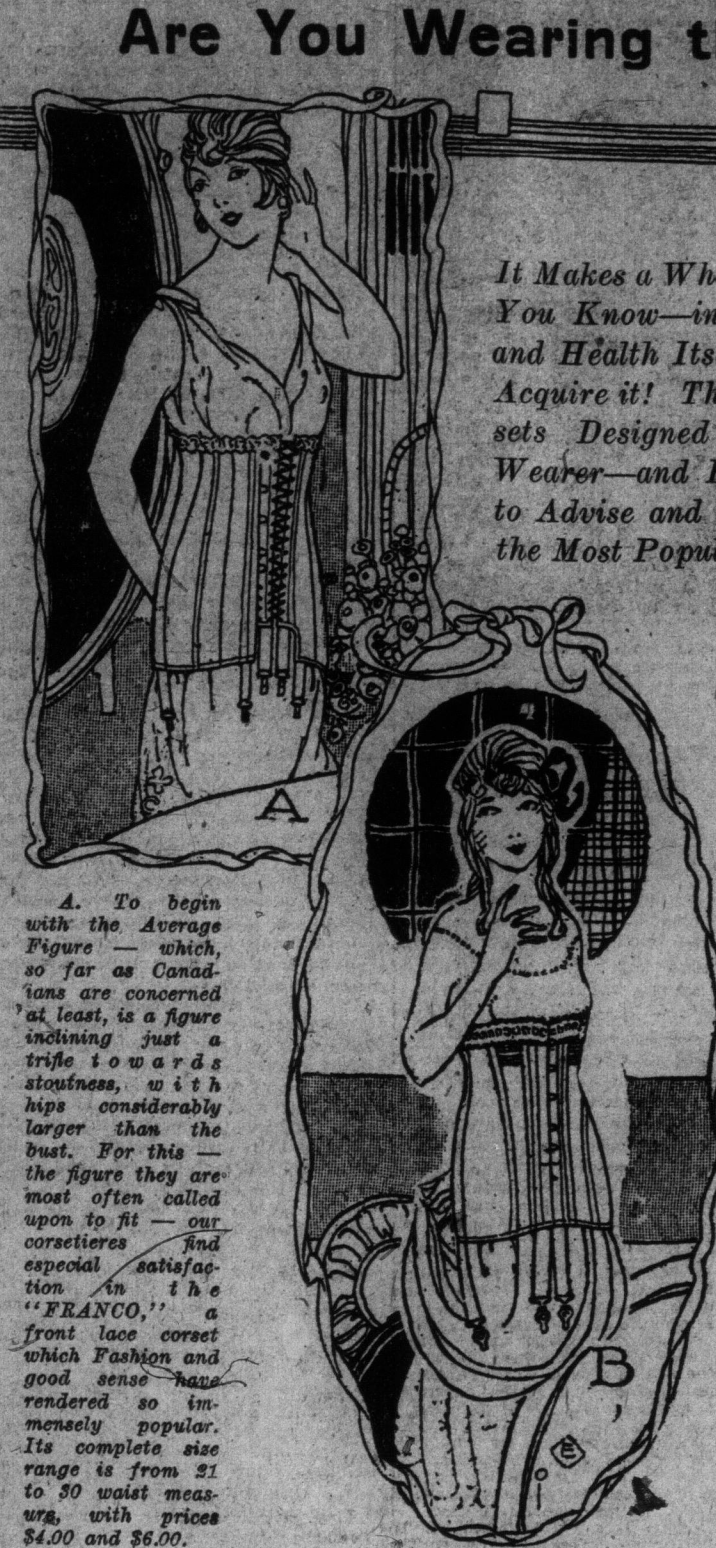
A. To begin with the Average Figure... B. The Misses' Figure—demanding little more of the corset...