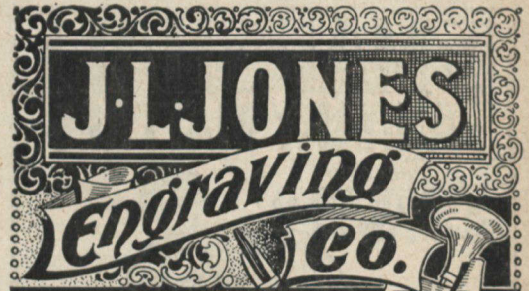
PHOTO & WOOD ENGRAVING AND ELECTROTYPING, FOR ALL ADVERTISING PURPOSES.

HEAD OFFICES: British Empire Building, Montreal Temple Building, - Toronto Agents Wanted