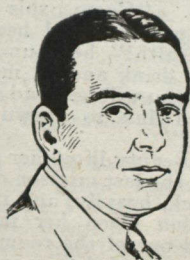
5. In for a Bad Glass Uk

I HOPE to release one of the greatest motion picture plays of my career this year. I have taken this play from a wonderful story written by America's happiest author. This story is abounding in love and humour, pathos and happiness. I am not going to tell you the name of this play until after this contest is over, but if you are one of the contestants, you will be one of the fortunate ones who will hear the name of it before anybody else. I will also write and tell you the name of the actor I select to play the leading part with me.