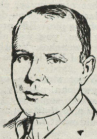
4. Sell Raw Hip