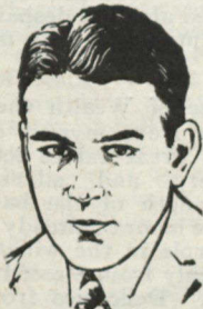
2. Learn a Lass