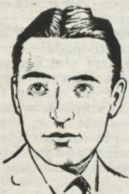
3. Jet Black Rig