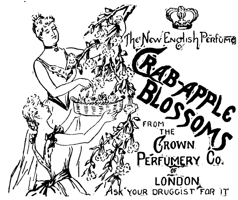
Sold by Lyman, Knox & Co., Toronto, and all leading druggists.