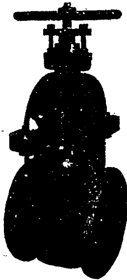
Flanged End Gate Valve with Hand Wheel.