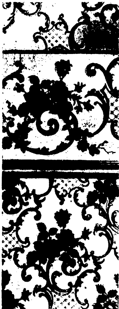
No. 17 Combination. MANUFACTURED BY WATSON, FOSTER & CO.

WE devote some space this month to wall papers, and to the new lines of this season. The Canadian factories have done particularly well, and some account of their most artistic productions will be found