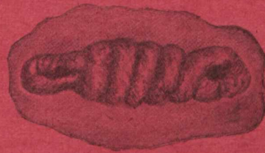
A Strand of Lead Wool coiled up for transit