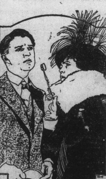
BRYANT WASHBURN "Something to Do"

He was the last word in uselessness. He never did anything for anybody in his life.