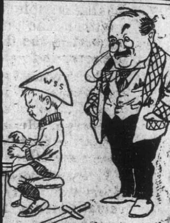
The Pirates' Hoard

kers-In old history... 8.50 PS-In Willow and... 7.00 n; from each $2 to... 6.50