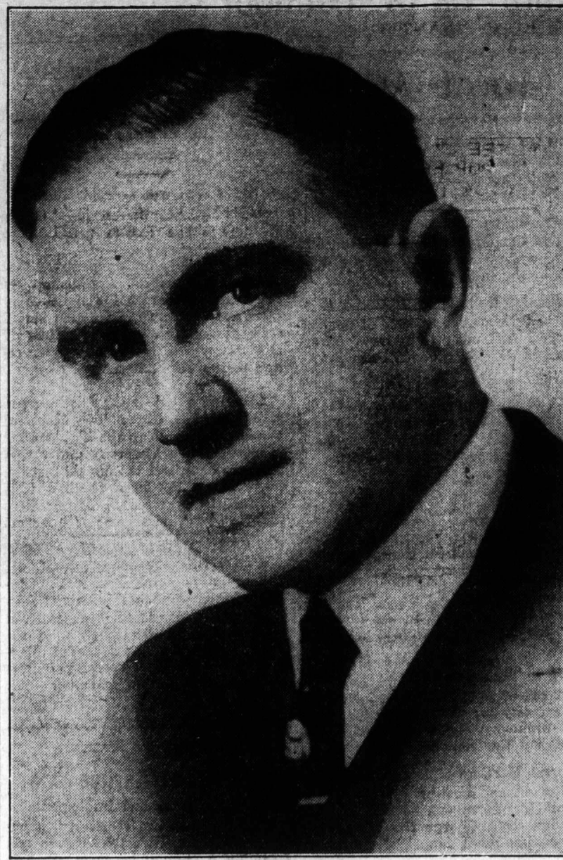
Late Comedian of "Top of the World" Company, who will have charge of the Daughters of the Empire of the "Night in Dreamland" to be produced here April 20 and 21.