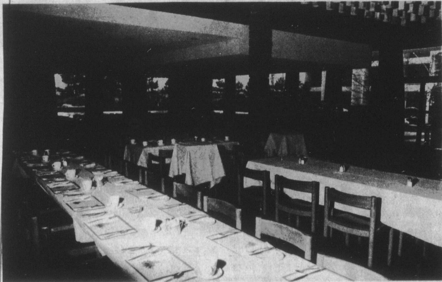
Some wonderful things have happened to the dining room at the Sherway Inn. This view shows where the partition has been removed allowing for a large dance floor and window tables overlooking the pool and patio.