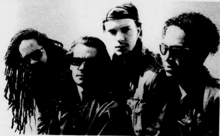
Montreal's Bootsauce strikes a pose laden with attitude. The band plays each gig like it was their last, which, given the way bands mutate these days, isn't totally unlikely, so get your tickets early.