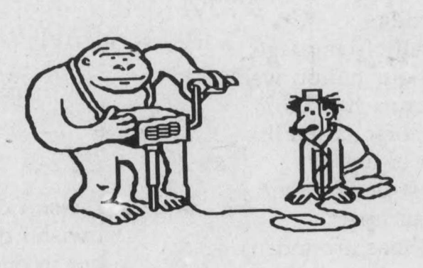
Embarrassing moments at gene parties