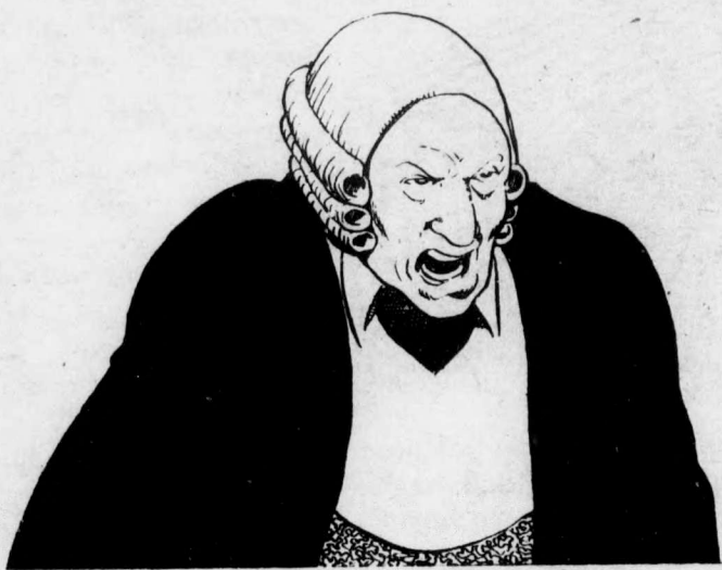
The bad guys (administration and other evil sorts)