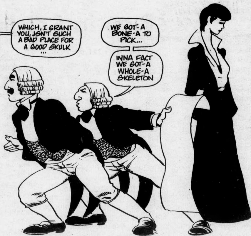
Pretty girl, for effect.