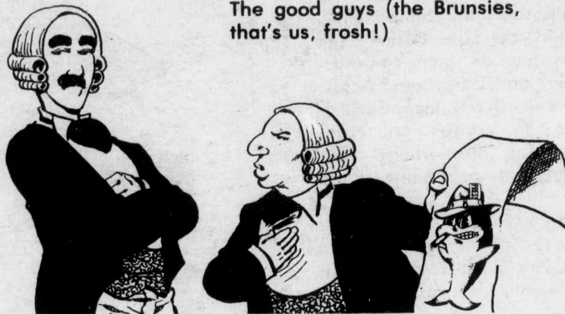
The good guys (the Brunxies, that's us, frosh!)