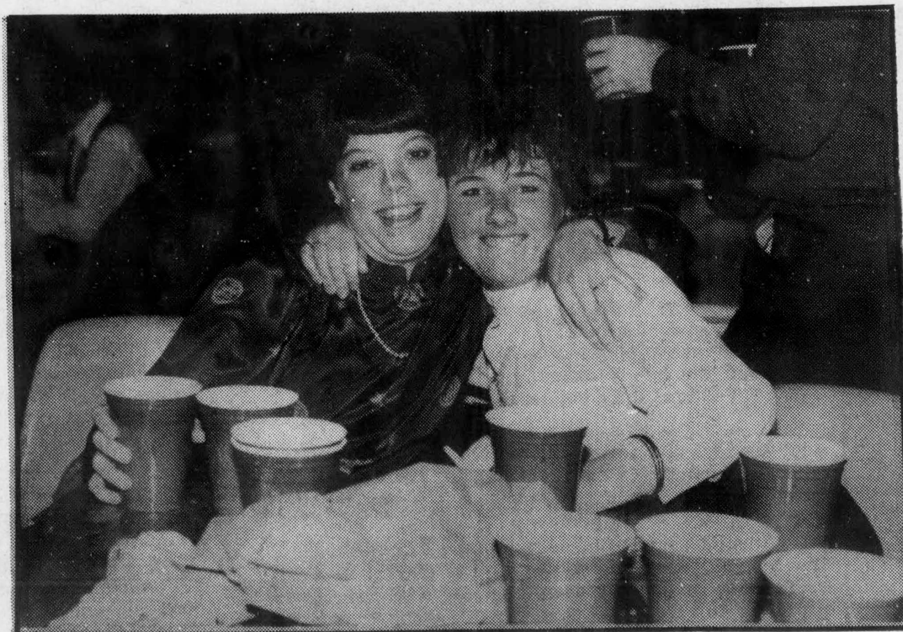
A couple of bums!!