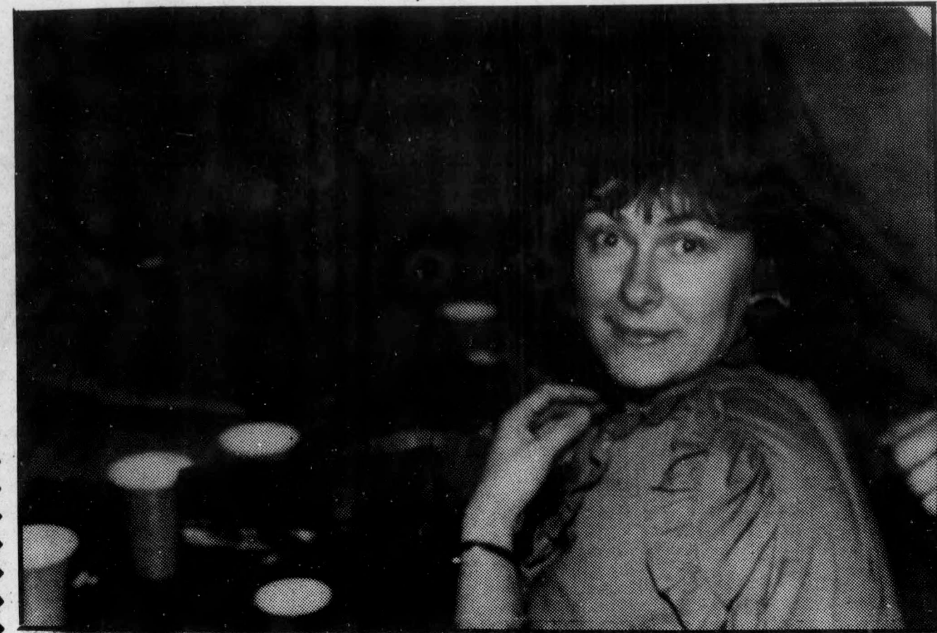
Someone who's someone)!

The Time: 8:00 p.m. The Date: January 21, 1984 The Place: The SUB Ballroom The Reason: CHSR-FM's 23rd Anniversary The People: Anyone who's anyone and