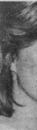
Who says Eng participants in